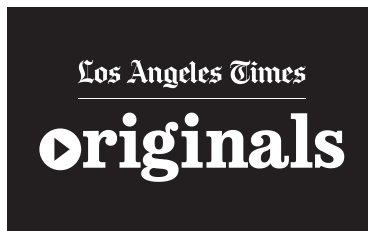
Logo in reverse